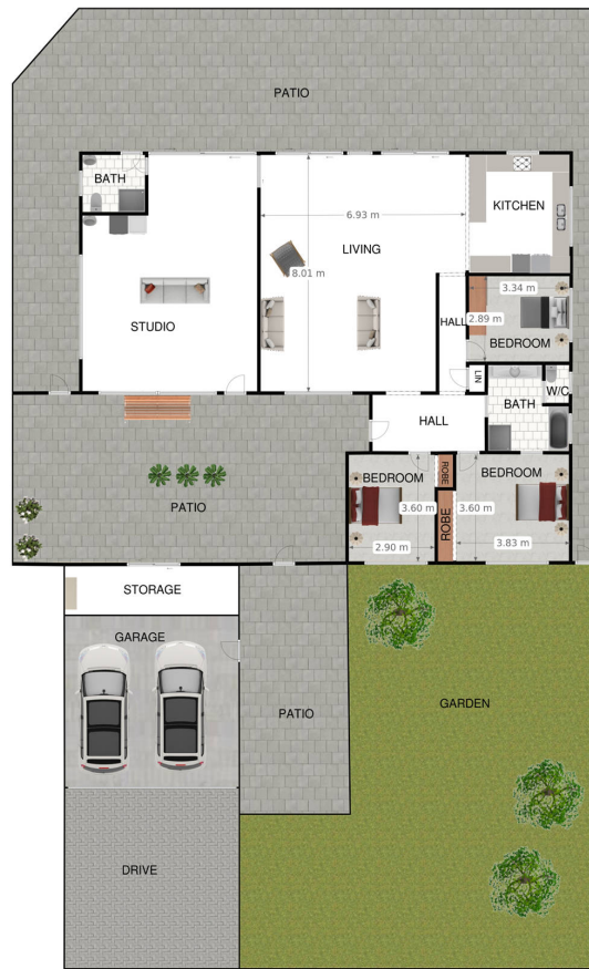
6 Barkala Court